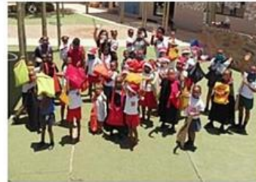
Little Bugs – Sossusvlei