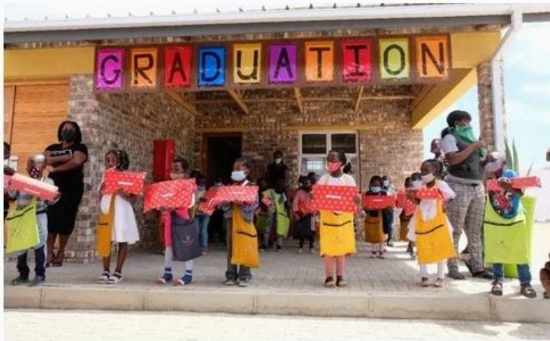
Grow Together DRC Swakopmund