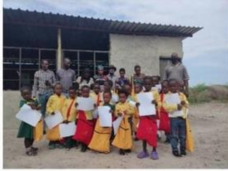
Namushasha Kindergarten – Katima