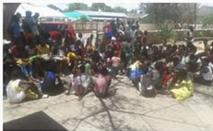
Light of Hope – Okahandja