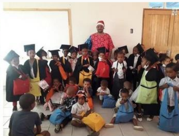
Khaibasen Community Center Bethanie