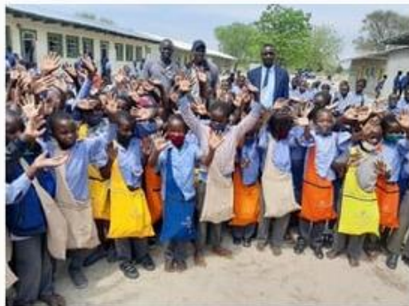
Chobe Ngoma Combined School