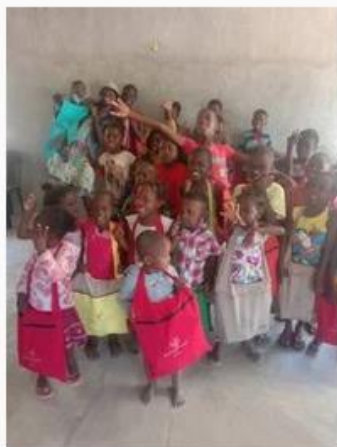
Heal the Land