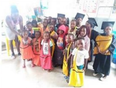
Kalundu – Katima