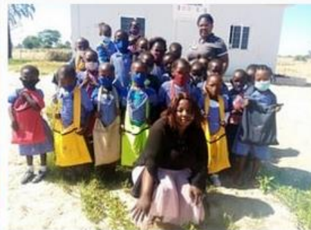
Paukeni – Rundu