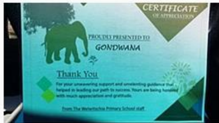
Welwitschia PS – Khorixas